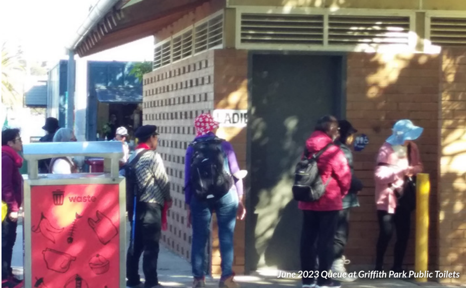
June 2023 Queue at Griffith Park Public Toilets