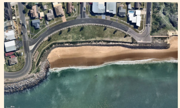
N end of seawall September 2024