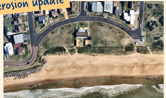
N end of seawall May 2017