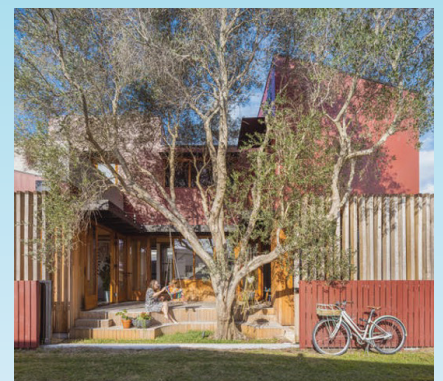
Olive Tree House, Pembroke St.

Awards include the Australian Institute of Architecture NSW 2024 Award for Sustainable Architecture, AIA Newcastle 2024 Award for Residential Houses (NSW) and Commendation in the Houses Magazine Awards for New house under 200m2. The house was also selected to be included on the NSW Planning Housing Good Design for Housing Map. We think this may be a first for Stockton!